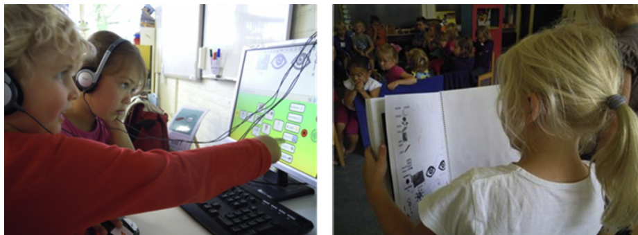
Fig. 1. Creating text on-computer (left); using text off-computer (right).

The term, PictoPal, pertains to the unique combination of on-computer and off-computer activities which is structured in a particular way. While the specific vocabulary and contents of each PictoPal modules varies, the structure is its defining feature, and this remains static. Consistent structural elements of PictoPal are: (1) brief preparatory activities before writing commences (usually small-group discussion concerning focusing on the content of the writing task); (2) the number of integrated on-computer- and off-computer activities (eight in